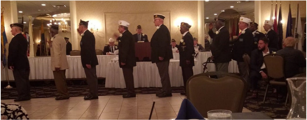
First Division officers standing by to be installed